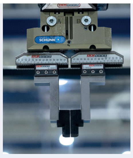
Robotic arm with sintered grippers