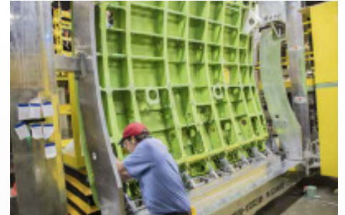
A Kawasaki manual operator working with a Boeing 777X cargo door.