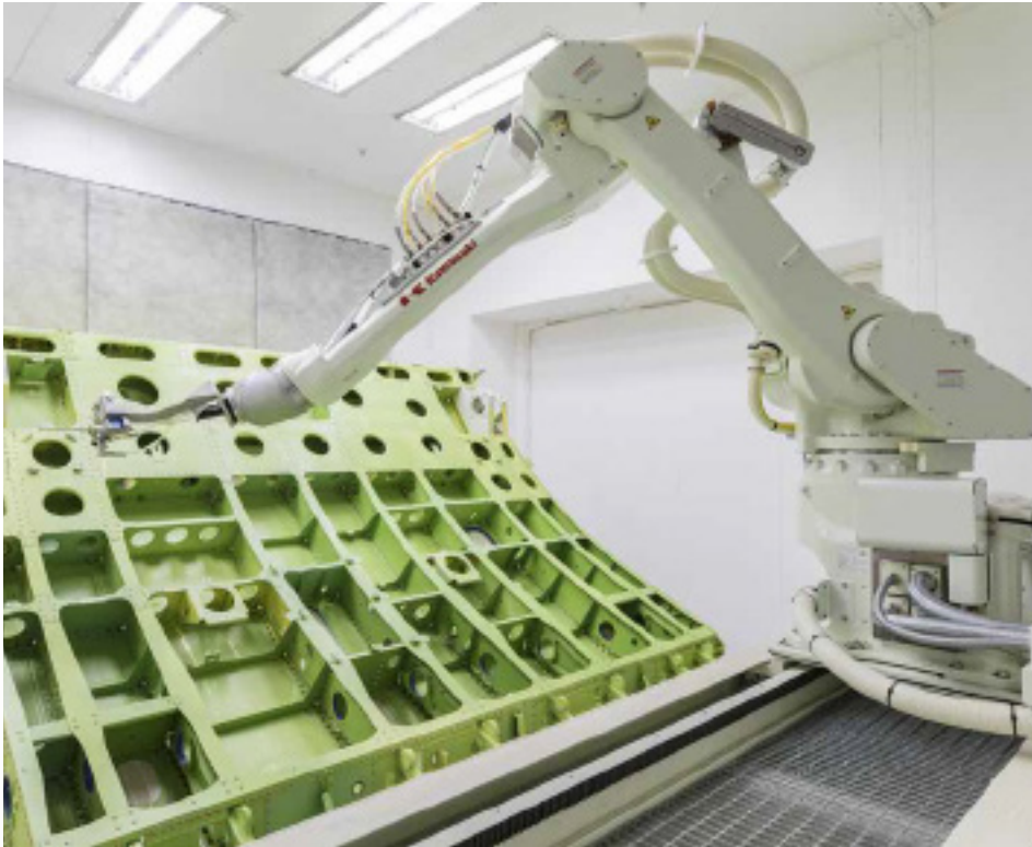
The manufacturing of Boeing 777X cargo doors with Kawasaki's automated manufacturing systems.