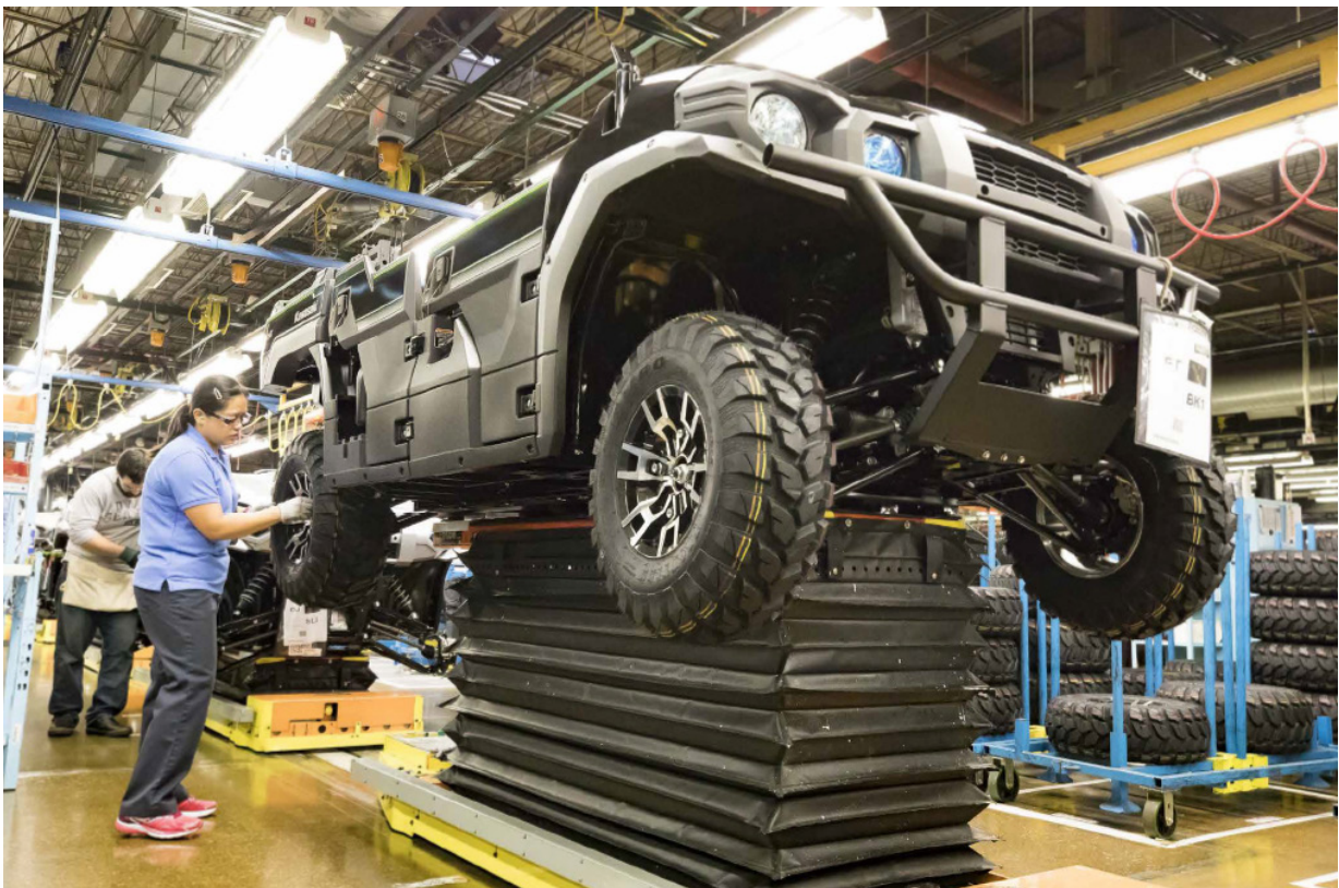
Part of Kawasaki Lincoln's production line for MULE utility vehicles.